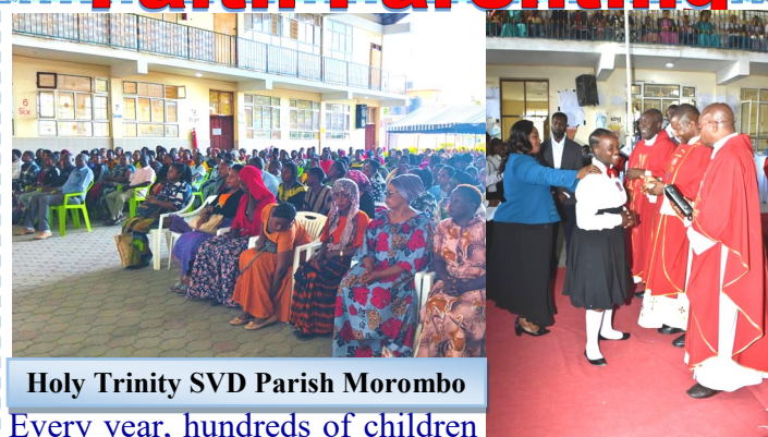
Holy Trinity SVD Parish Morombo

Every year, hundreds of children receive their First Holy Communion and Confirmation in our parishes. However, majority of them stop going to Church soon after for various reasons and therefore do not get ongoing faith formation. Involving the Parent in the faith formation of their children is one of the strategies to reduce children dropout from the Church.